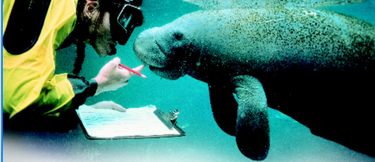
▲ Figure 1-2 ● The goal of science is to investigate and understand nature. The first step in this process is making observations. This researcher is observing the behavior of a manatee in Florida.

Inferring Explain to students that some scientists use the following method when confronted with a problem to be solved: organize, analyze, evaluate, make inferences, and predict trends from data. Explain what each of these skills involves. For example, scientists often organize data into tables and graphs. They analyze the data through processes such as noting how manipulated variables affect responding variables. They evaluate data by checking its accuracy and reliability, including any measurements. Scientists make logical interpretations, or inferences, based on observations and knowledge. They predict trends by looking at trends shown in the data they already have. Also refer students to Appendix A in their textbooks. After you have explained and discussed science process skills, have students apply them to a real-world situation. For example, students might analyze newspaper weather data and predict trends based on the data. L2 L3