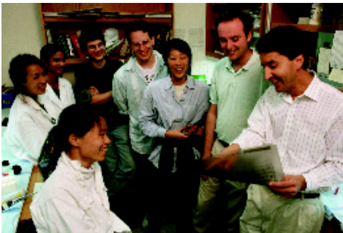
◀ Figure 1–4 Researchers often collaborate by working in teams, combining imagination and logic to develop and test hypotheses. Applying Concepts How do scientists decide whether to accept or reject a hypothesis?

CHECKPOINT How do scientists develop hypotheses?