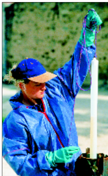
◀ Figure 1-3 Researchers testing water for lead pollution cannot test every drop, so they check small amounts, called samples. Inferring How might a local community use such scientific information?